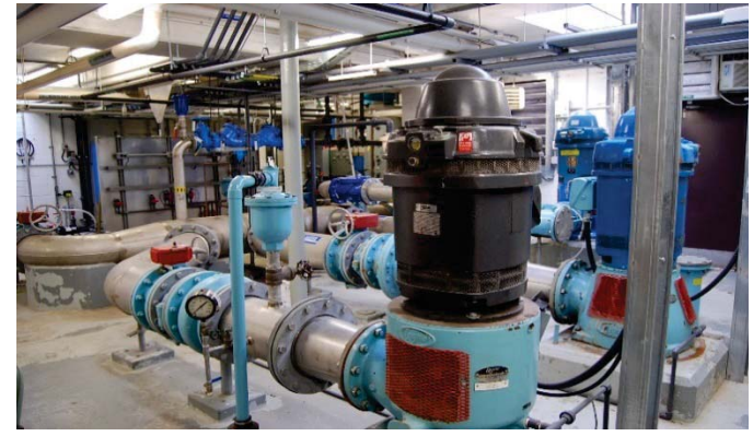
Pour plus de renseignements sur l'eau potable en Ontario, consultez le site www.ontario.ca/eaupotable

De nombreux documents utiles peuvent vous aider à exploiter votre réseau d'eau potable. Vous trouverez ci-après une liste de documents que les propriétaires et exploitants de réseaux résidentiels municipaux d'eau potable utilisent fréquemment. Pour accéder à ces documents en ligne, cliquez sur leur titre dans le tableau cidessous ou faites une recherche à l'aide de votre navigateur Web. Communiquez avec le ministère au 1-866-793-2588, ou encore à waterforms@ontario.ca si vous avez des questions ou besoin d'aide.